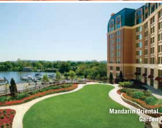
Mandarin Oriental Garden