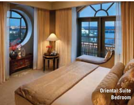
Oriental Suite Bedroom