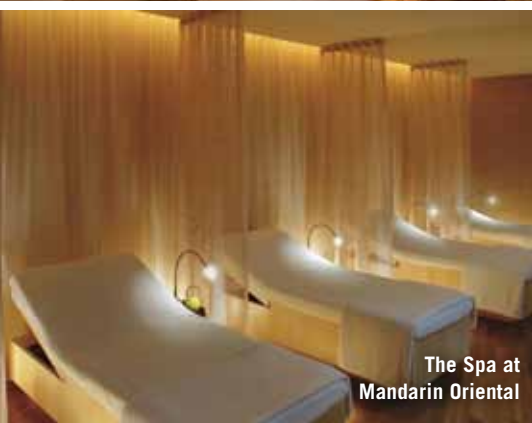
The Spa at Mandarin Oriental